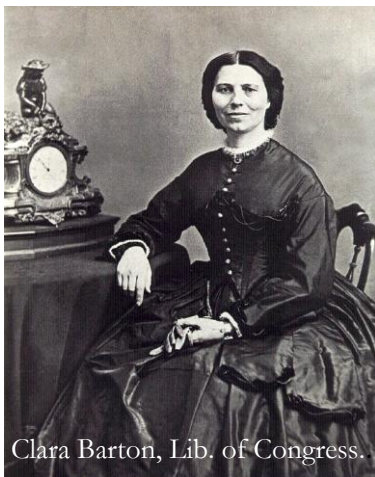
Clara Barton, Lib. of Congress.