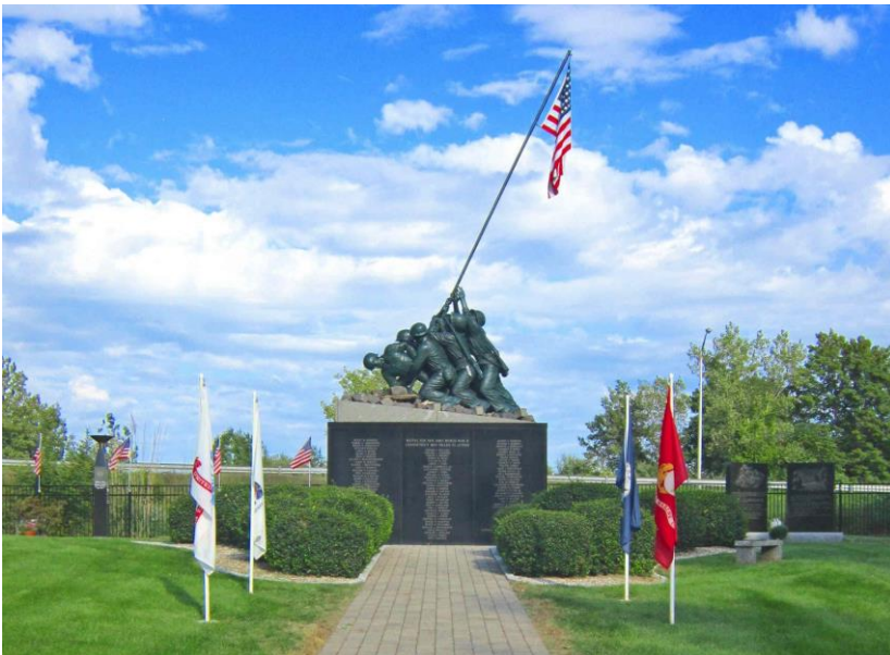
Connecticut's National Iwo Jima Memorial Monument in New Britain