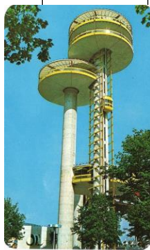
New York State Observation Towers