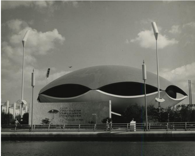
The Travelers Insurance Companies, 1964 New York World's Fair.