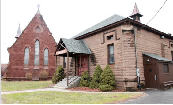
Corning Hall (r) stands behind St. John's Church (l), January 2017.

In 1909 the Vestry voted to accept the offer of Miss Mary Corning to construct a building to be used for recreational and community purposes. Shortly thereafter Corning Hall was build. It is located at 12 Rector Street, behind the church building. No longer needed as a recreational building, it was remodeled in the 1970's to meet the needs as a parish hall and community meeting center.