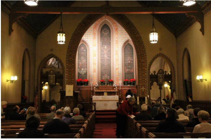
St. John's church and parishioners await the start of their final service on Christmas Eve.