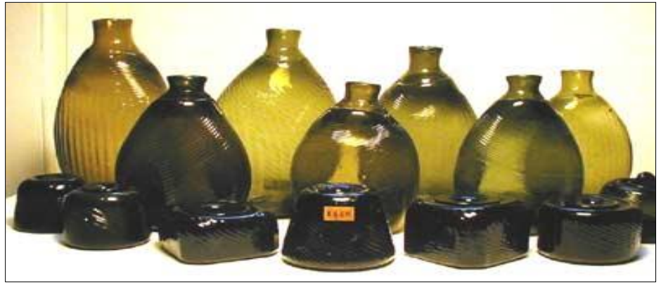
“The Pitkin Glassworks 1783-1830. Fine groupings of fine Pitkin-Type flasks and inkwells blown on the half-post method.”