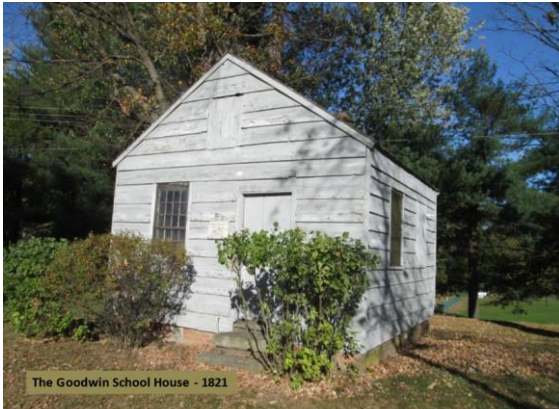
The Goodwin Schoolhouse, ca 1823, at the entrance to Martin Park, East Hartford.