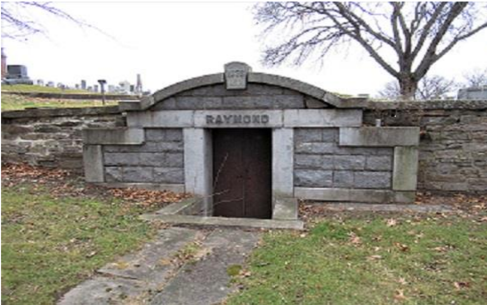
Raymond Family Vault in Center Cemetery, East Hartford